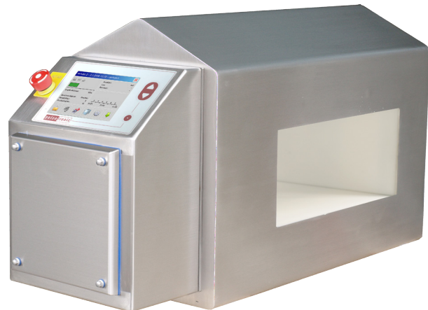
Tunnel Detector BD

Depending on the operating electronics the handling is realised via a membrane keyboard with LC-display or Touchscreen. Thus all important parameters can be viewed easily and fast and changed if necessary. The sensitivity of the detector also is adjustable this way. Detailed information you will find in the documentation of the electronics M-PULSE2, M-PULSE and Digital+.